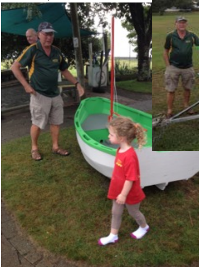
On its voyage back to The Playcentre