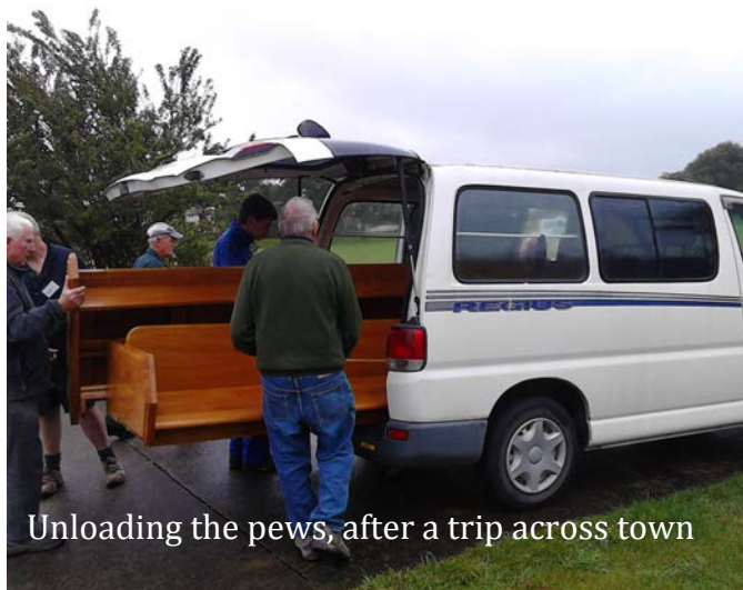
Unloading the pews, after a trip across town