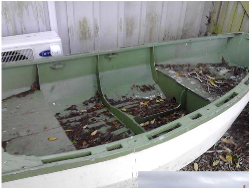
Before work started