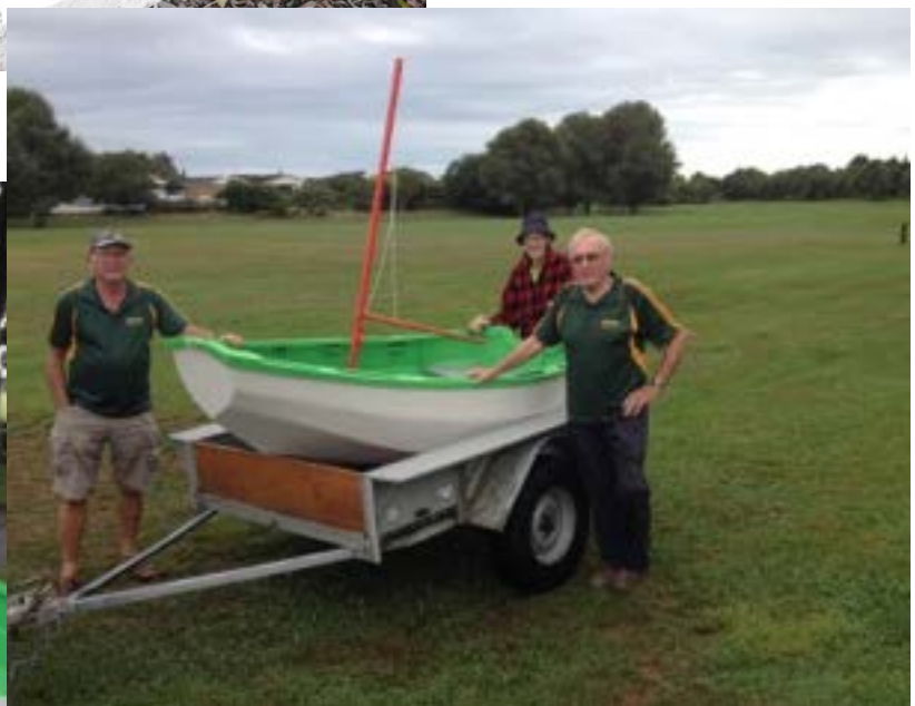
Installed on site.